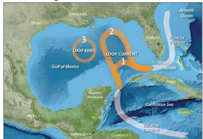
FIGURE 1 The flow patterns of the Gulf of Mexico Loop Current System.

The Loop Current System (see Figure 1) includes the Loop Current, a warm ocean current that flows northward through the Yucatán Channel up into the Gulf of Mexico where it eventually meanders eastward and southward before exiting out through the Florida Straits and feeding into the Gulf Stream; it also includes Loop Current eddies, which are circular currents that occasionally separate from the main flow of the Loop Current and move westward. The position of the Loop Current varies from a retracted state, where it flows from the Yucatán Channel nearly directly east to the Florida Straits, to an extended state, where it flows into the northern and western Gulf before exiting through the Florida Straits. The Loop Current eddies that occasionally shed from the main flow of the Loop Current can extend over large areas (~300 km diameter) and can persist for months as they drift slowly west toward Texas and Mexico. As this system of the Loop Current and its eddies moves through the Gulf of Mexico, it brings with it large, deep masses of warmer water and strong currents that influence all types of ocean processes, including oil and gas exploration and production.